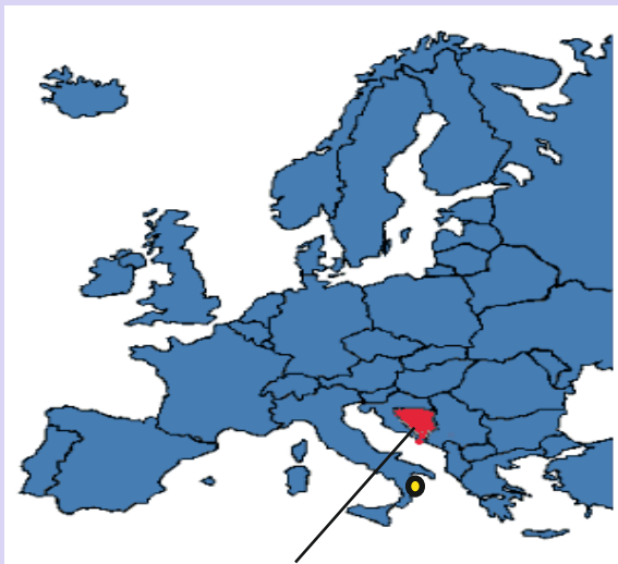
ZENICA, EMFM 2015